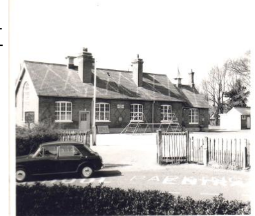
St Mary's school building in 1968