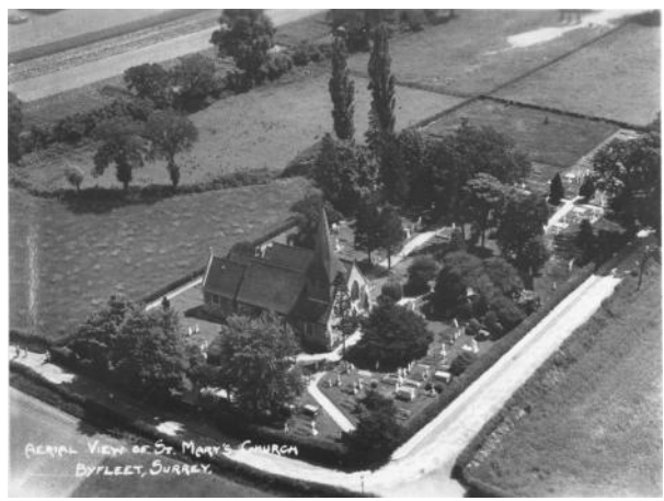
St Mary's church from the air (in the 1920s)