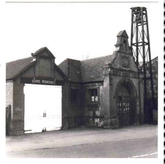
The Fire Station in 1968

Please go to www.gofundme.com and search for Save Byfleet Fire Station to read more about the Trust's plans and please donate if you can. Thank you.